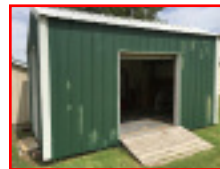
10'x16 w/OH door