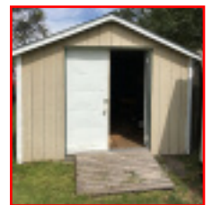
10X16 w/5ft door