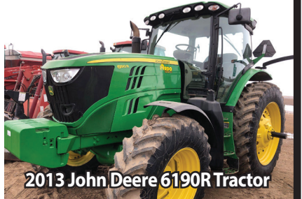
2013 John Deere 6190R Tractor