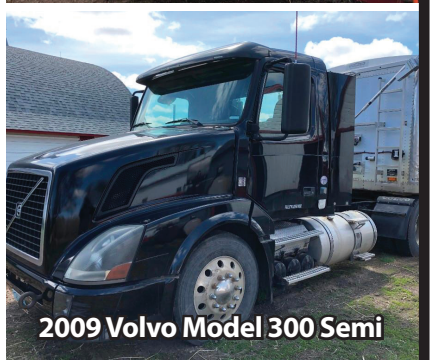
2009 Volvo Model 300 Semi