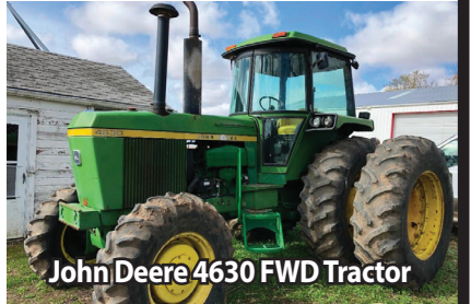
John Deere 4630 FWD Tractor

From Millarton, ND: At the intersection of 80th Ave. SE and 52nd St. SE, proceed 1 ¼ miles west on 52nd St. SE.