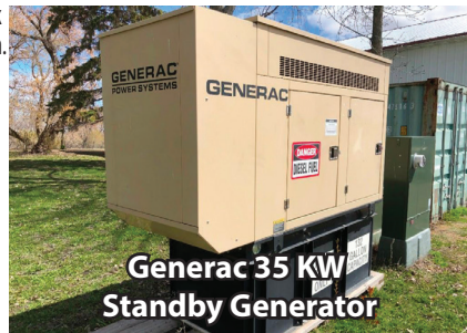
Generac 35 KW Standby Generator