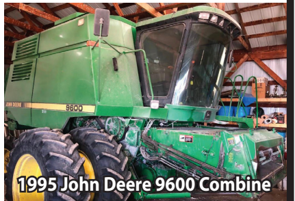
1995 John Deere 9600 Combine