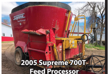
2005 Supreme 700T Feed Processor