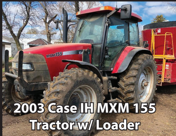
2003 Case IH MXM 155 Tractor w/ Loader