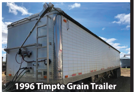
1996 Timpfe Grain Trailer