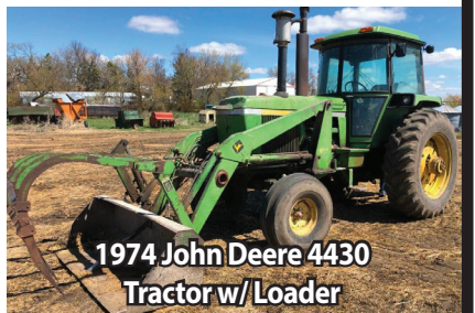
1974 John Deere 4430 Tractor w/ Loader