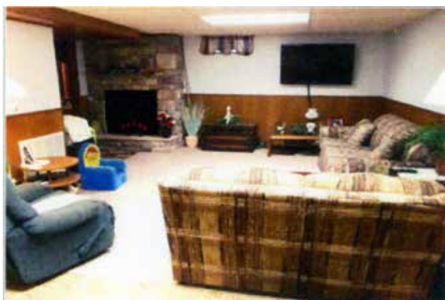
family room w/fireplace

Viewings: 4 to 6 p.m. Sundays until day of sale or by appointment with auctioneers 217-343-7680 or 217-821-2863