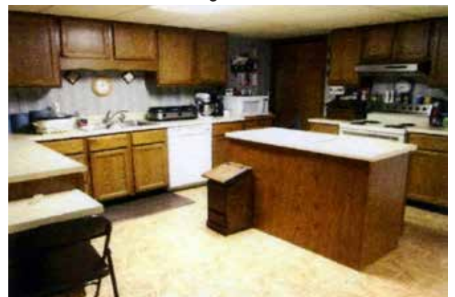
2 full kitchens, upstairs & downstairs