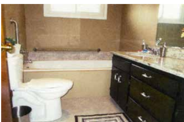
2 full baths