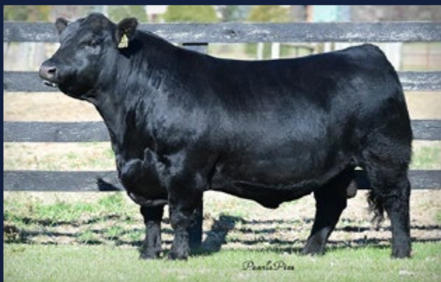
SAV America 8018